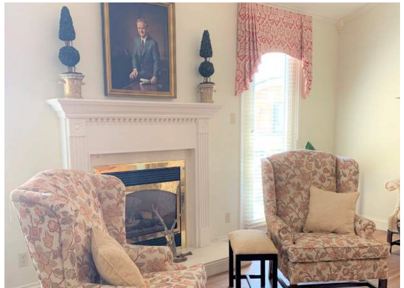
The Harrell Library provides a quiet space to peruse books or have a seat and read.