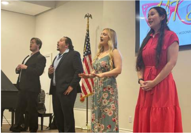
The Shreveport Opera Xpress kicked off the 2025 CATS series at The Glen.

The 2025 season of CATS: Events on Culture, Arts, Science, and Technology is in full swing!