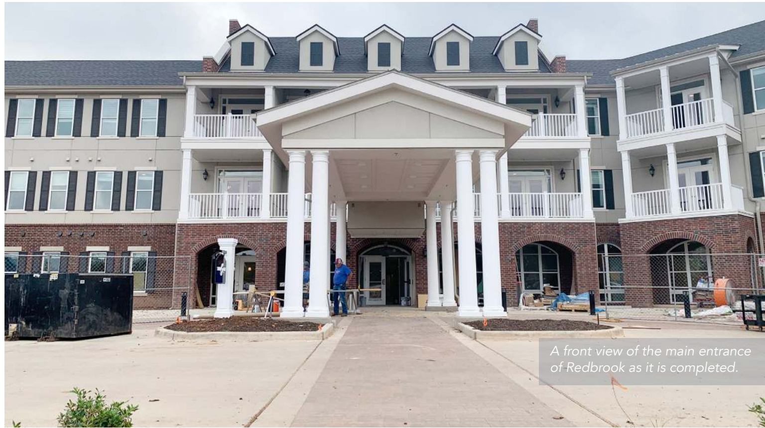
A front view of the main entrance of Redbrook as it is completed.