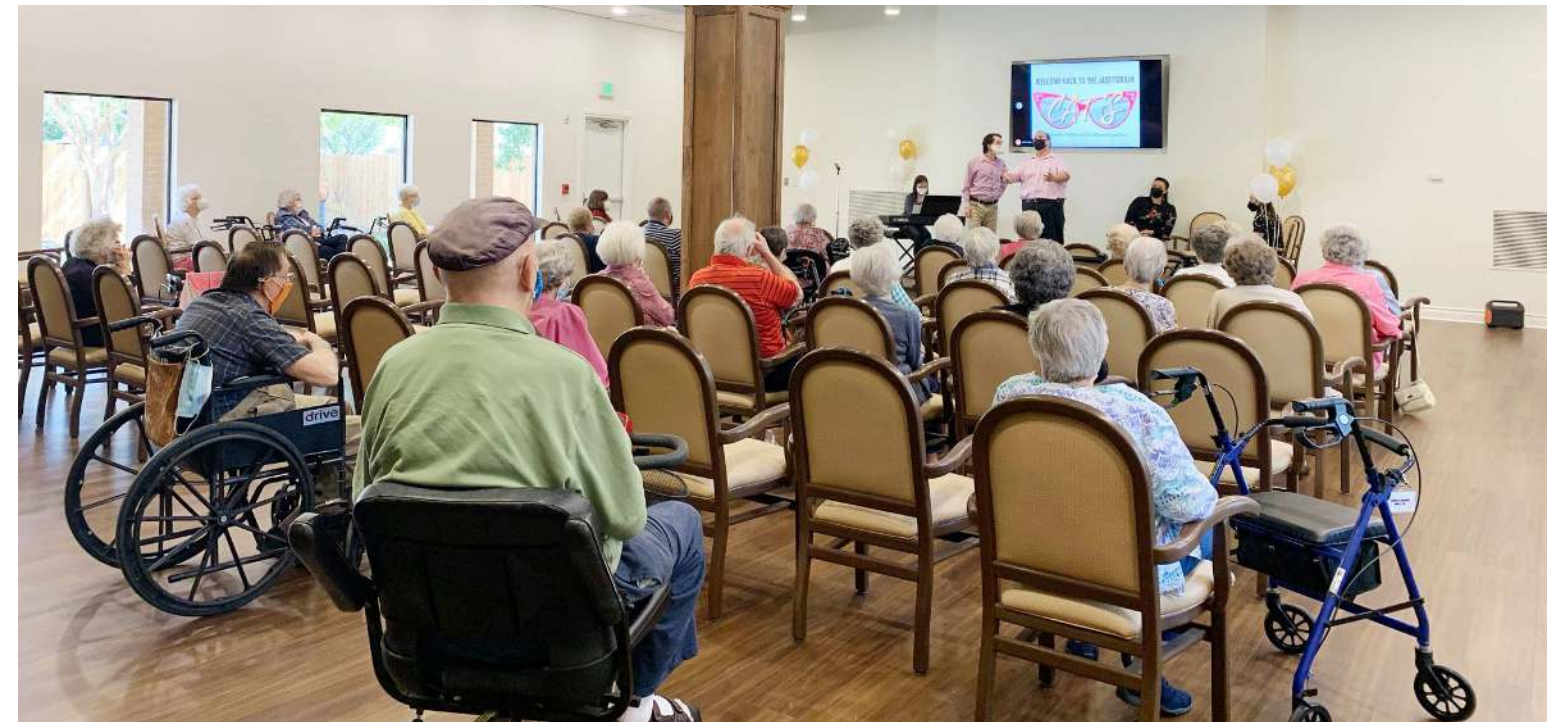
The Shreveport Opera performed for residents at The Glen in the newly-renovated auditorium in September.