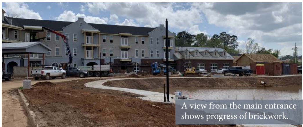
A view from the main entrance shows progress of brickwork.