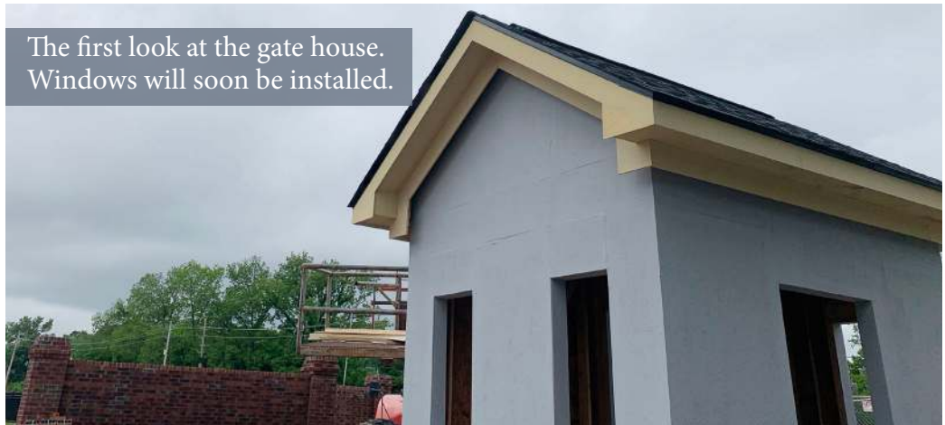
The first look at the gate house. Windows will soon be installed.