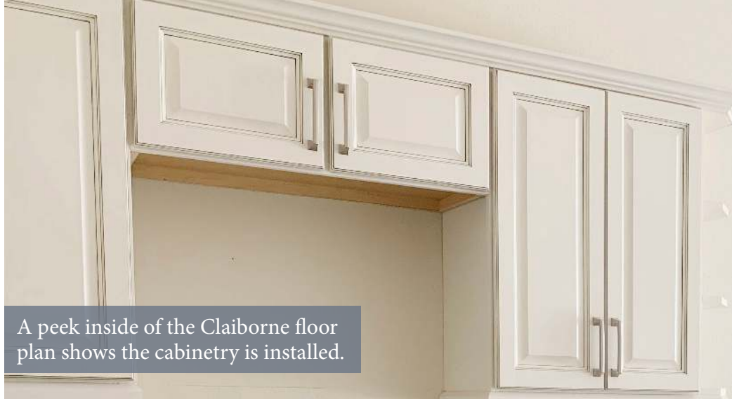
A peek inside of the Claiborne floor plan shows the cabinetry is installed.